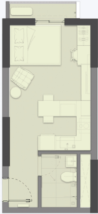
STUDIO UNIT 350 SQ.FT